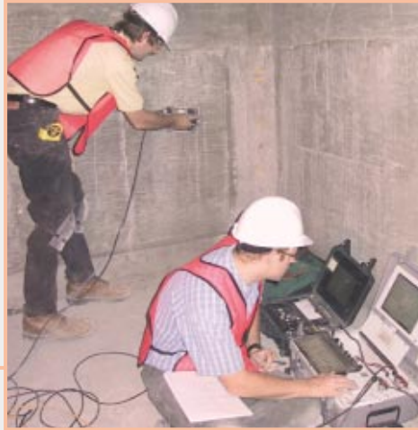
Locating tendons using GPR