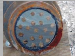
Result of void grouted with Vacuum Grouting