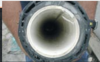
Simulated Repair of Cracked HDPE (White Pipe) duct using Half Pipe (Outer black Pipe). Annulus between pipes has been grouted.