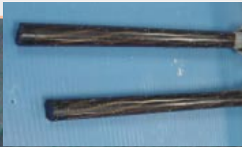
Dynashield applied to prestressing strand

The DSI Half Pipe also allows for the complete removal of the existing HDPE pipe to assess the condition of the grout and strands, if required, prior to its installation.