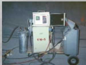
Digital Volumeter with leak compensating capabilities

DSI is able to determine the volume of the void through the use of a Digital Volumeter with leak compensating capabilities.