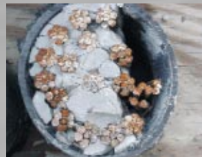
Result of void grouted with conventional methods

DSI uses only ASBI certified grout technicians cross trained in NDT inspection. All technicians have extensive experience in both pressure and vacuum grouting techniques employing thixotropic grout.