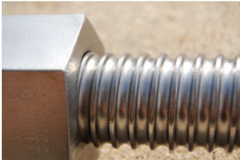
Cold Rolled THREADBAR® with Hexnut